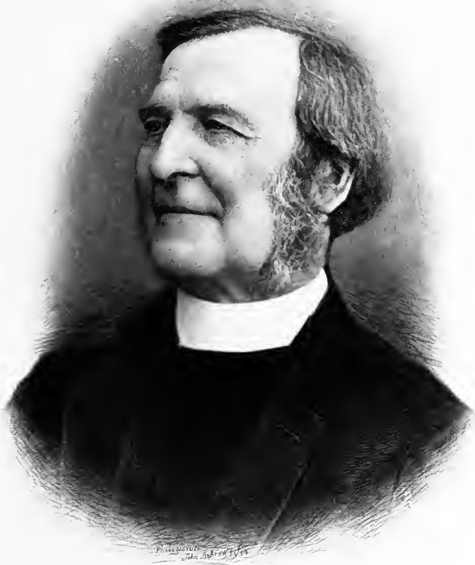
THE ARCHBISHOP OF CANTERBURY.